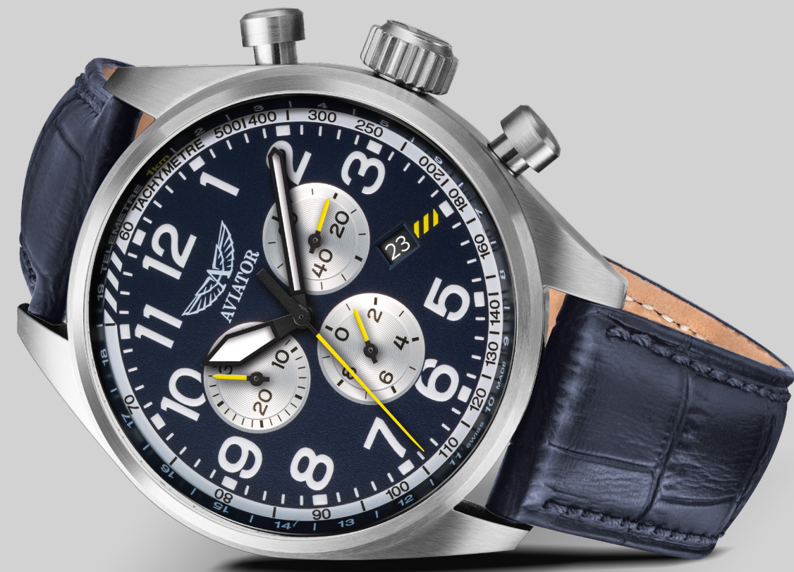
AIRACOBRA ///P45 CHRONO